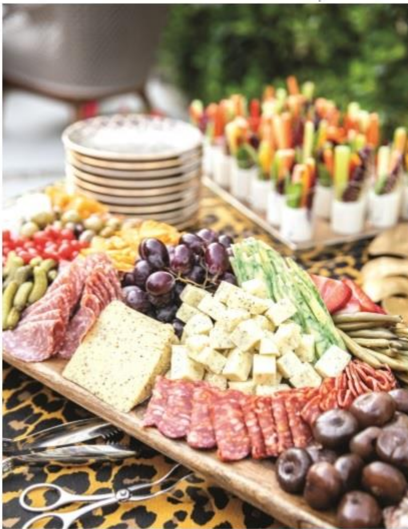
clockwise from top: In the "desert oasis" of the hosts' backyard, a luxe charcuterie board by On the Mark and colorful crudité sit on a L'Objet tablecloth. Guests mingle as hors d'oeuvres emerge on silver trays. A Lalique crystal panther and gold luster tiger guard the dessert table. Cake by Over the Rainbow Desserts. Fortuny plates find their way to the fire pit.